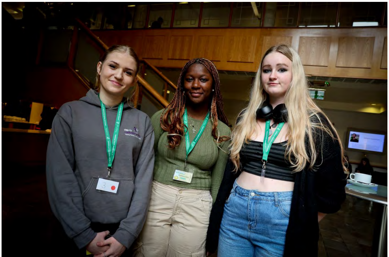
Delegates at the Rural Youth Assembly 2023

The space was evaluated positively by the delegates with 96.3% feeling very comfortable giving their view. “Being able to give my opinion and making new friends” was one of the highlights of the day for a delegate.