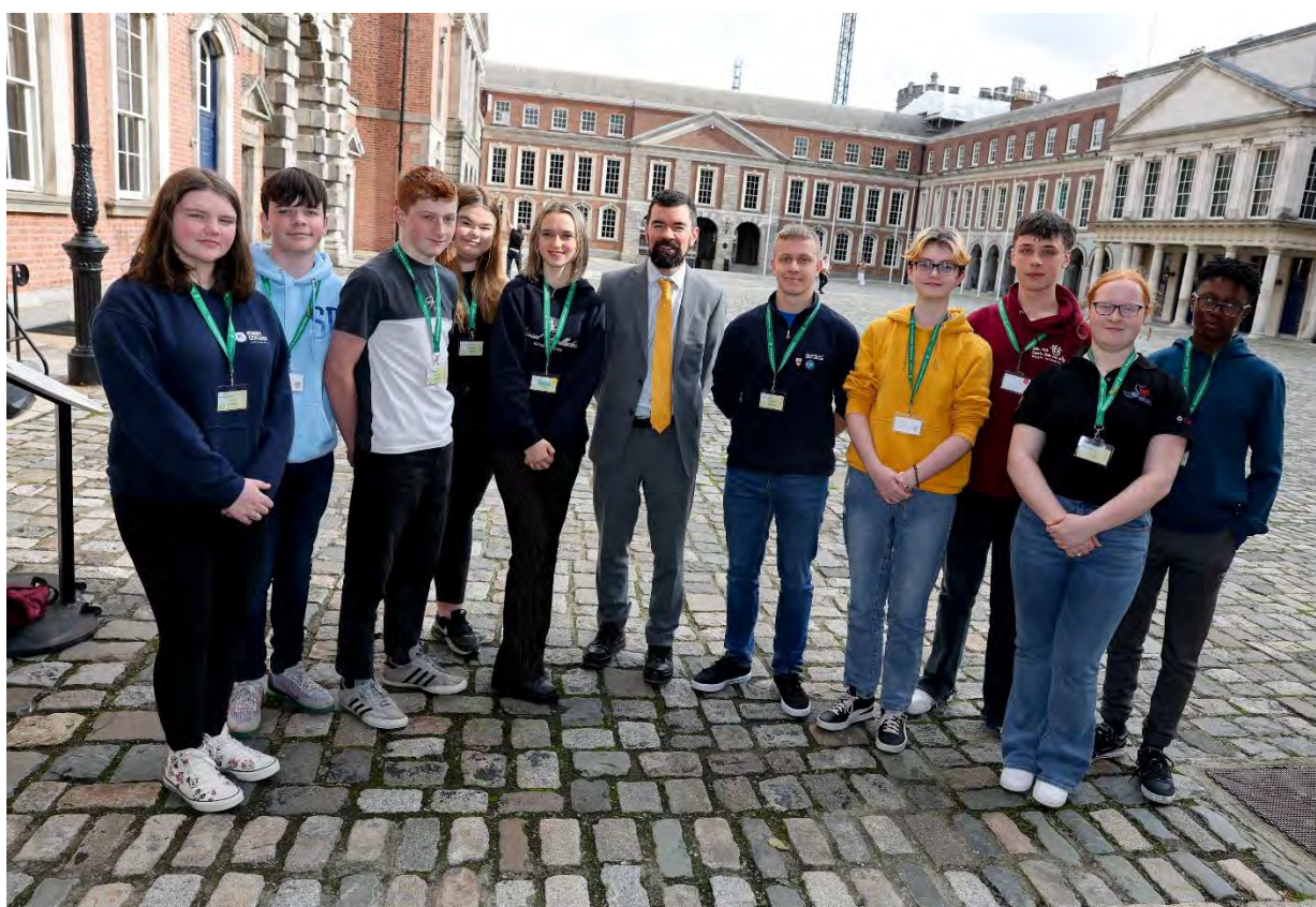
Joe O'Brien T.D., Minister of State with responsibility for Community Development and Charities, and Minister of State with responsibility for Integration, with delegates at the 2023 Rural Youth Assembly, Dublin Castle.

The National Rural Assembly convened on Tuesday the 3 rd of October 2023 in the Hibernia Centre, Dublin Castle. The National Rural Youth Assembly is a collaboration between the Department of Rural and Community Development (DRCD) and the Department of Children, Equality, Disability, Integration and Youth (DCEDIY).