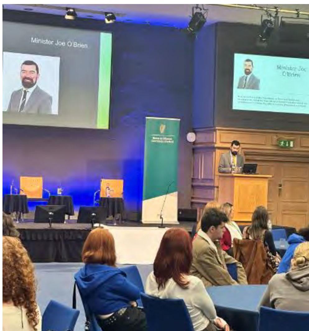
Joe O'Brien T.D., Minister of State with responsibility for Community Development and Charities, and Minister of State with responsibility for Integration, opening the 2023 Rural Youth Assembly, Dublin Castle.