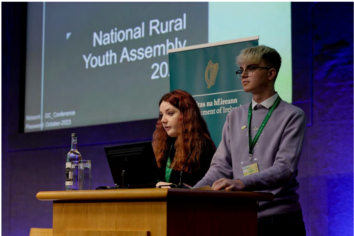
Delegates at the Rural Youth Assembly 2023

The National Rural Youth Assembly arose from a consultation process in 2019 for Our Rural Future , which is Ireland's Rural Development Policy for 2021-2025. During this consultation process, DRCD held two events to obtain the views of young people living in rural Ireland. The idea for the Assembly was proposed by youth groups during the consultations, and the establishment of the Rural Youth Assembly became a key commitment in the policy. The Rural Youth Assembly is jointly convened by DRCD and DCEDIY, with facilitation by the National Participation Office.