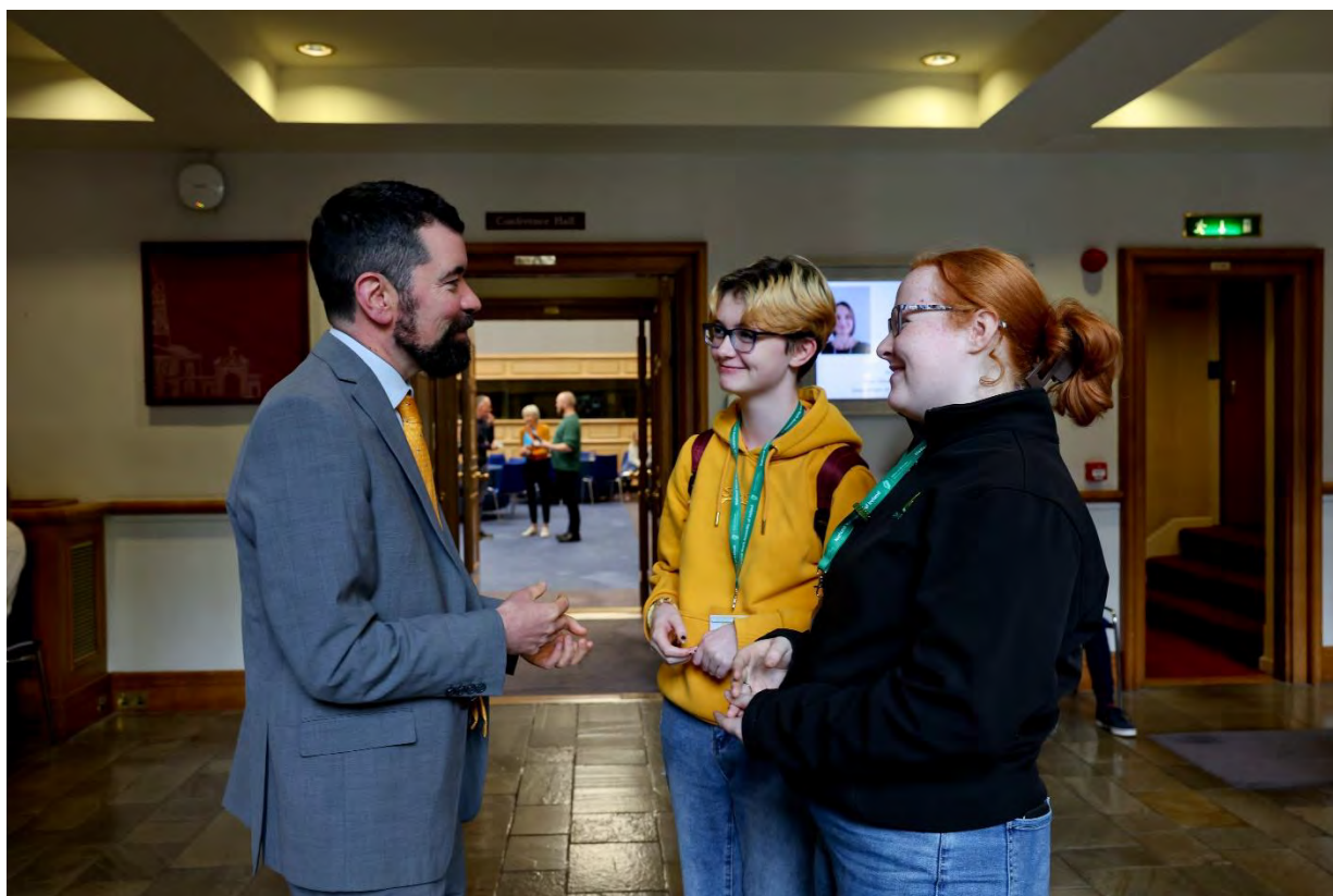
Minister of State Joe O'Brien with delegates at the Rural Youth Assembly 2023