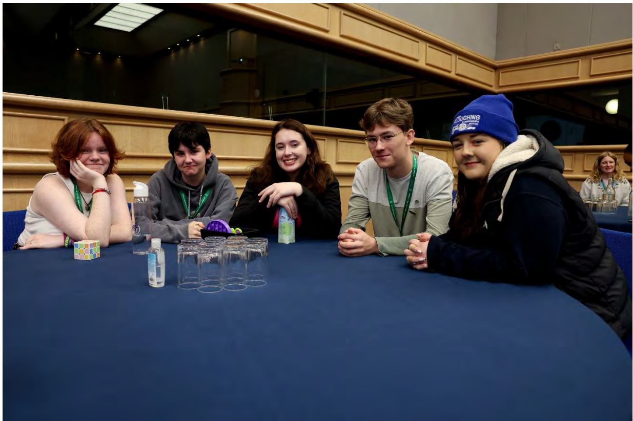
Delegates at the Rural Youth Assembly 2023

The 60 delegates ranged in ages from 12 to 24 years and came from Carlow, Cavan, Cork, Donegal, Dublin, Galway, Kerry, Kildare, Kilkenny, Laois, Leitrim, Limerick, Longford, Louth, Mayo, Meath, Monaghan, Offaly, Roscommon, Sligo, Tipperary, and Wexford. These delegates are nominated from Comhairle na nÓg (youth councils) and a broad range of different Youth and Community organisations to represent different perspectives. Delegates are selected through a fair and transparent process with clear selection criteria, and they have support from staff from their Comhairle or youth and community organisations. All materials designed using the Dyslexia Association of Ireland guidelines were available printed, online and, where possible, videos had subtitles.