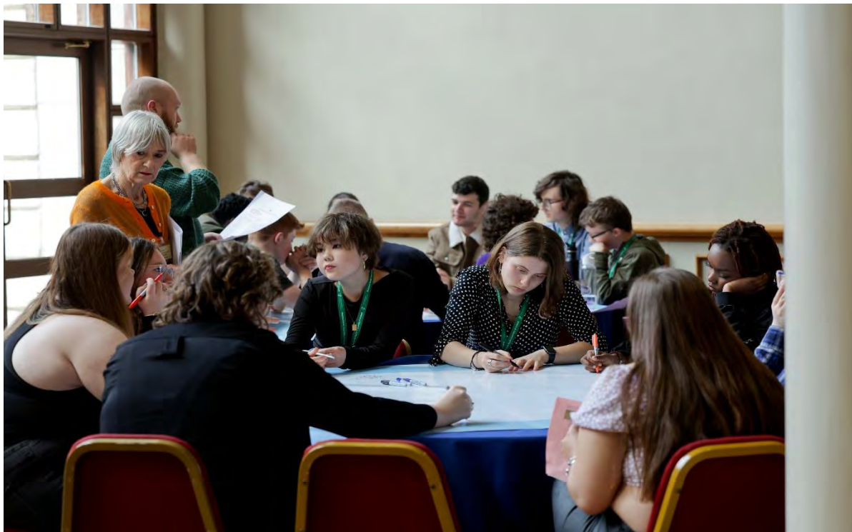
Workshop at the Rural Youth Assembly 2023

Delegates expressed the opinion that stigma, discrimination and stereotyping often impact their volunteering experience. They felt that they could be discriminated against due to their age and that youth stereotyping by adults either leads to adult distrust of them or to young people feeling infantilised. Solutions suggested were more information and education about the value of young people volunteering.