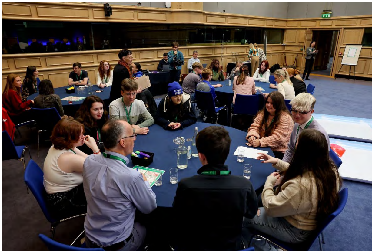
Workshop at Rural Youth Assembly 2023

Recommendation 3: Create free, safe, accessible spaces for young people to interact and grow in a healthy and welcoming environment e.g., parks, centres, gyms, playgrounds, pitches. This should be included in urban planning within 18 months and going forward.